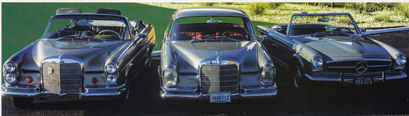
Pictured from left: 1967 Mercedes 280 SE Convertible, 1966 Mercedes 300 SE Coupe, 1966 Mercedes 230 SL