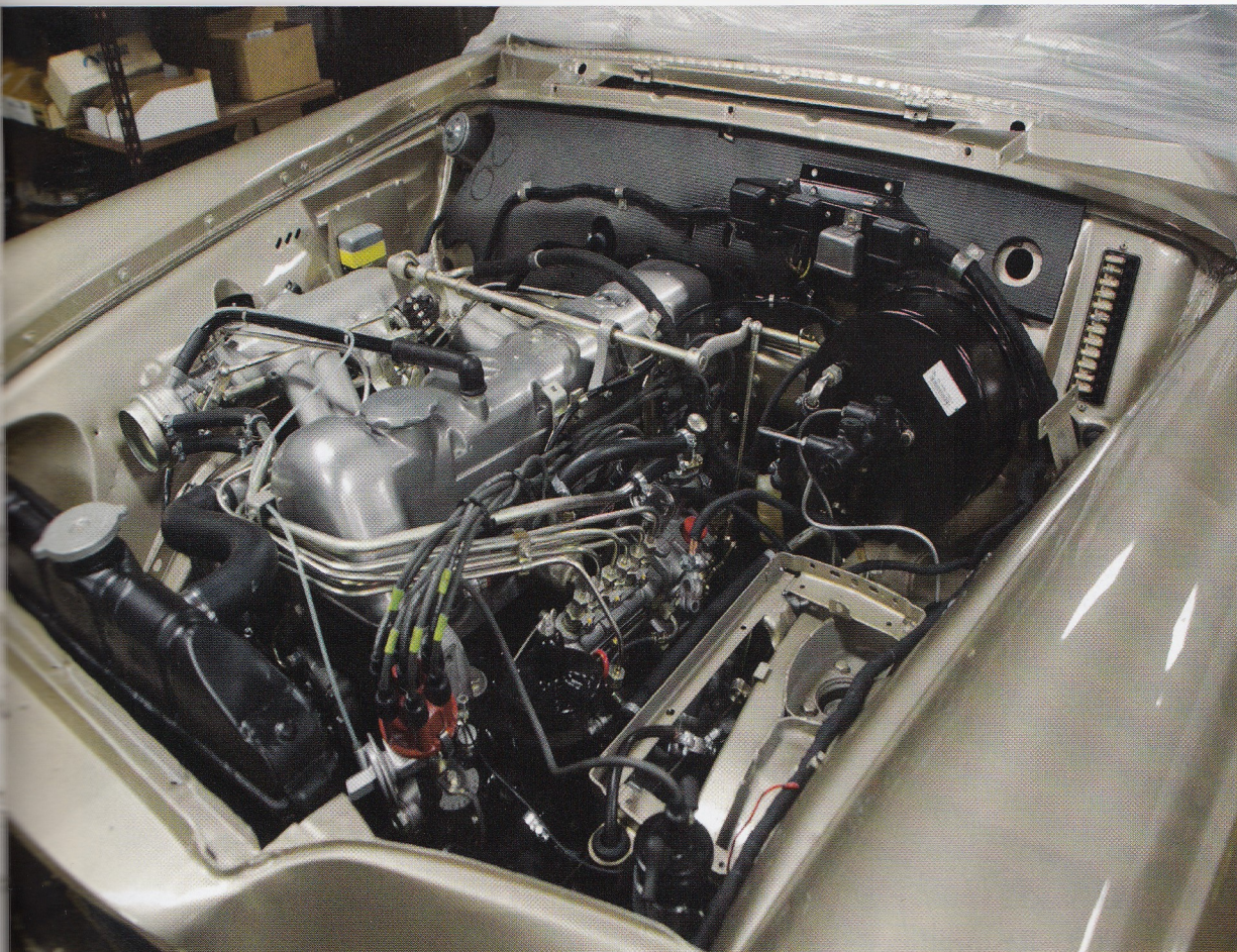
1967 Mercedes 250 Restoration Project

Audis, VWs, Land Rovers, Jaguars, and Volvos, as well as other makes.