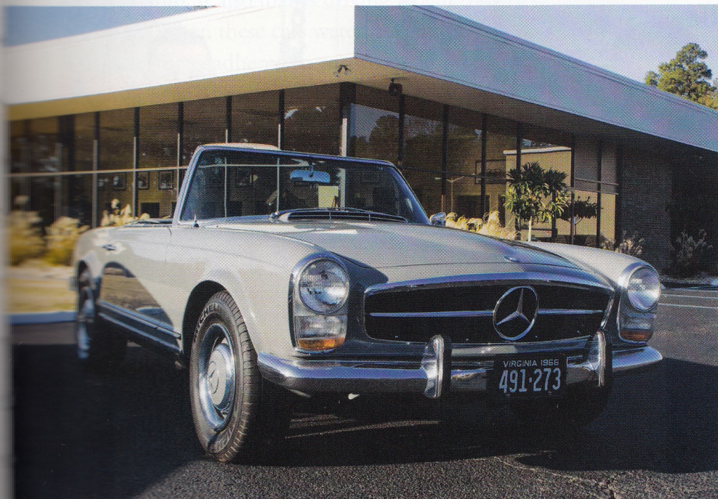
1966 Mercedes 230 SL