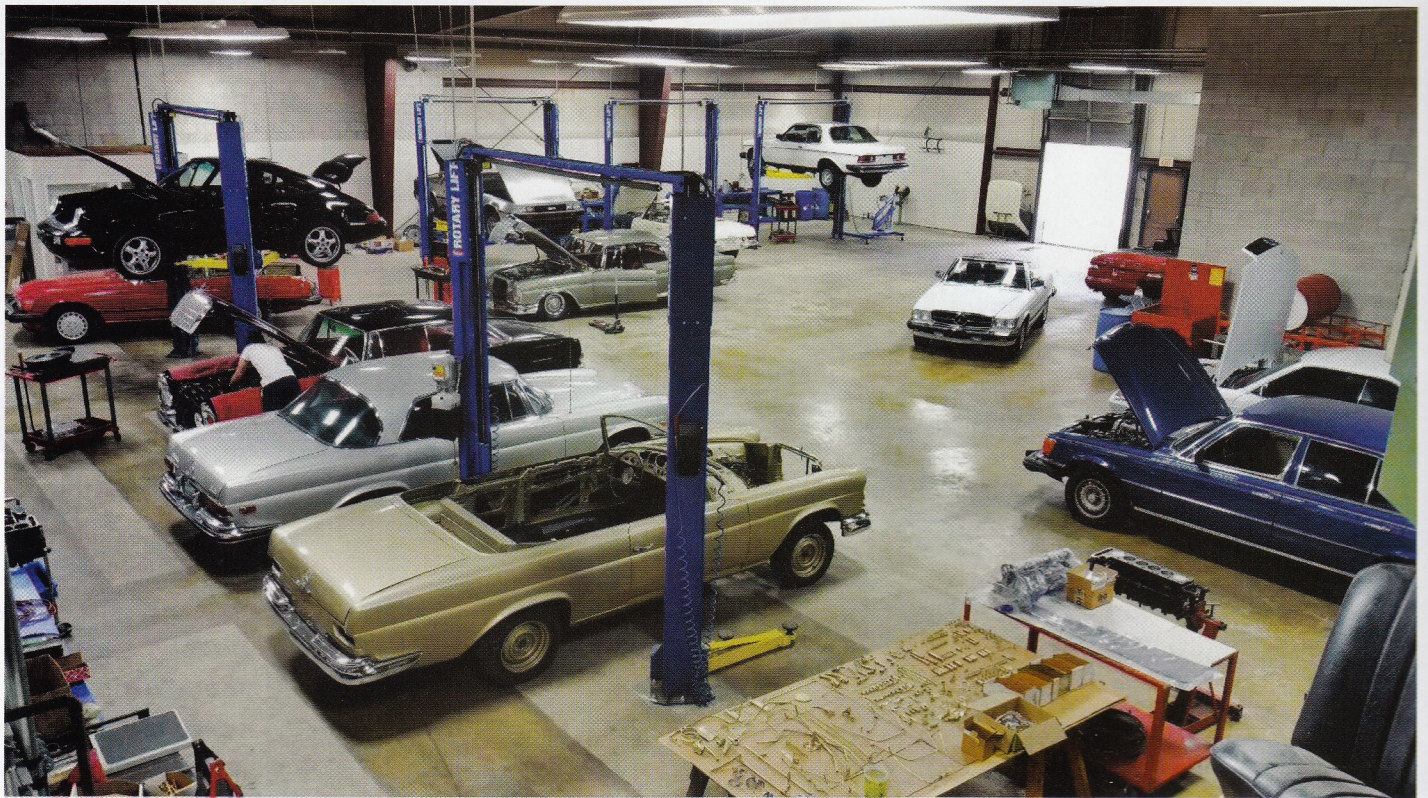
Restoration Projects Workshop Area